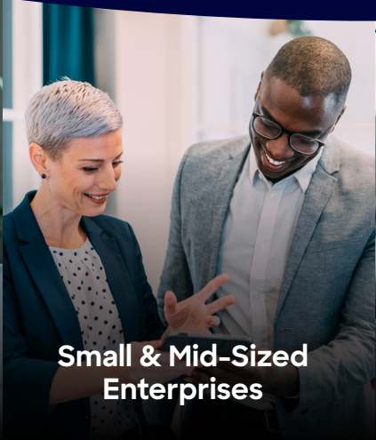
Small & Mid-Sized Enterprises