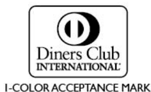
1-COLOR ACCEPTANCE MARK

BLACK-AND-WHITE VERSION SHOULD ONLY BE USED WHEN A MERCHANT IS PRODUCING THE PIECE AND ALL THE MARKS APPEAR IN BLACK INK